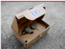
mareike gast refugee radio