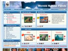
edo-jan meijer wnf-film